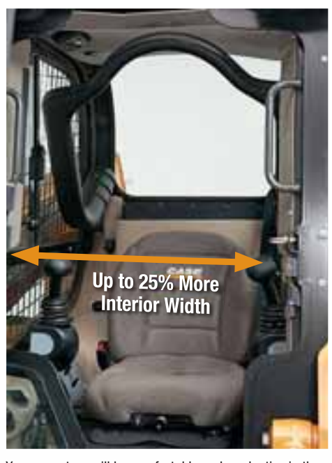
Your operators will be comfortable and productive in the spacious cab.

Plus, they'll run all day long, thanks to improved fuel efficiency and new 76- to 96.5-lt fuel tanks. One demonstration will prove it's time to trade up.