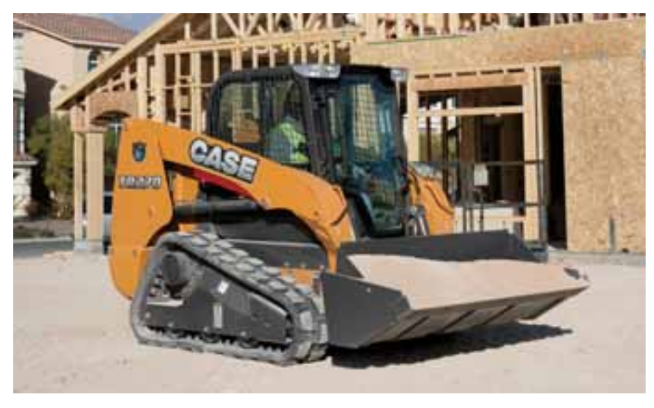
Designed to take on the toughest challenges, these new CTLs are engineered to boost your productivity and profits.

The technology on our rollers and idlers reduces maintenance costs and increases undercarriage life. Plus, our new, narrow chassis width makes it easy to load and unload on trailers.